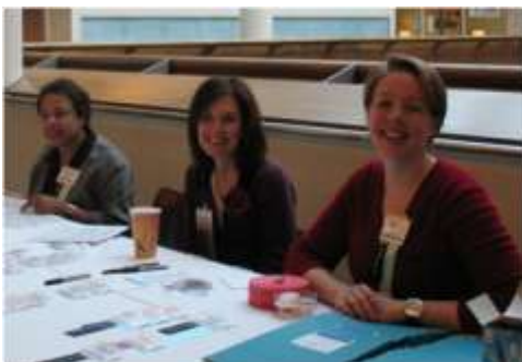
Left: Friendly greeters at the 2008 Symposium registration table